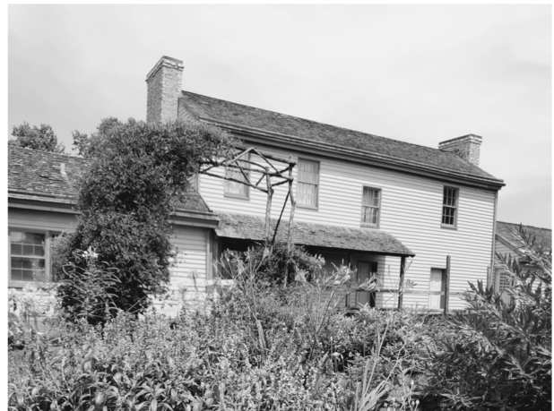
Thank you to the members of the Tri-City Garden Club for maintaining the historic garden at the house. It is the first thing visitors walk by and it is a beautiful welcome.