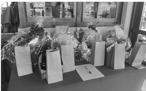
The CDHF will be the charity of choice at Green Tree Brewery in LeClaire on Tuesday, January 24 for the Euchre tournament. Come and play euchre and get great raffle baskets.