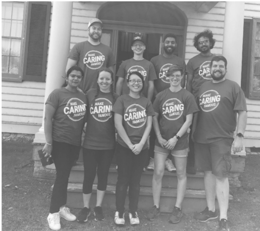
Thank you to the United Way Day of Caring volunteers from John Deere for their help doing a deep clean at the house and for fixing the touchscreen.